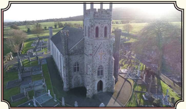
Holy Cross Church

Church Services and Events for this week. Services can be viewed via our webcam www.graiguecullenkillesbin.com