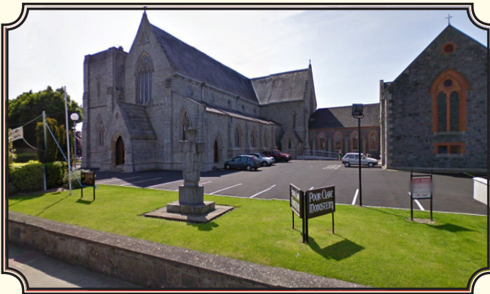
St. Clare's Church