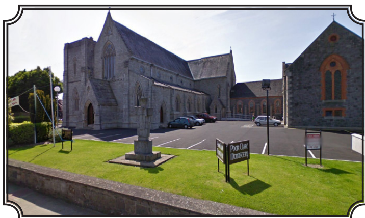
St. Clare's Church