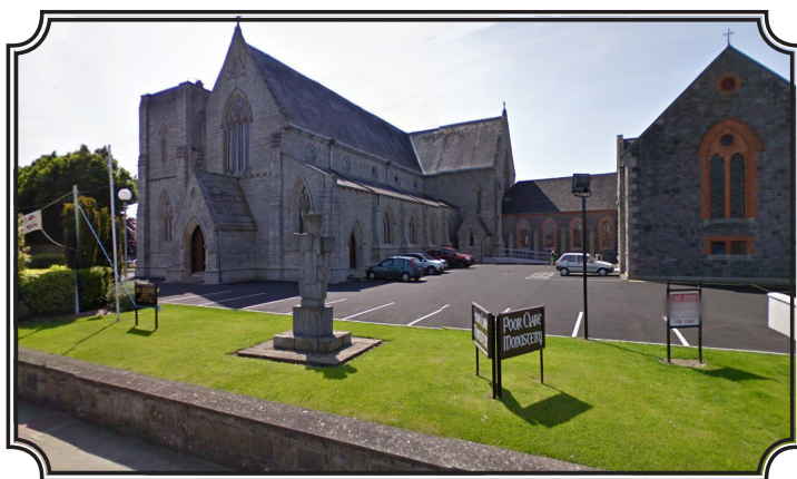
St. Clare's Church