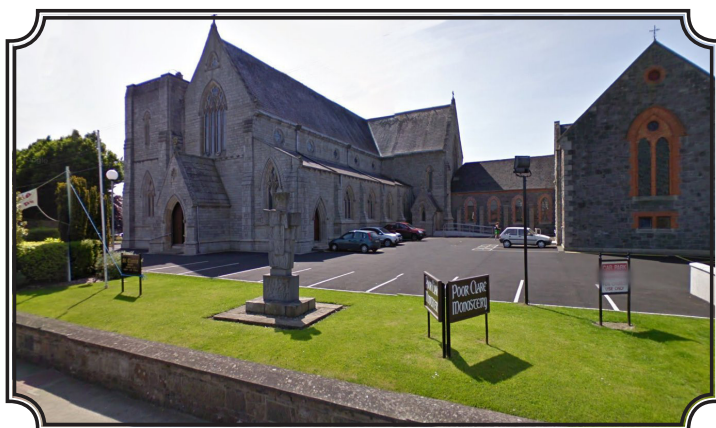
St. Clare's Church